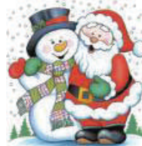
Christmas joy warms the heart