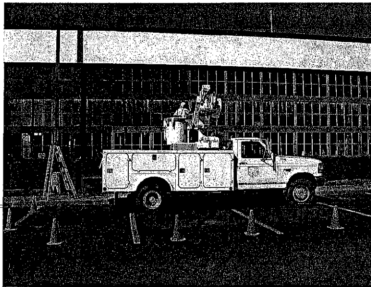
"Washington County DPW Painting Project"

Mission: To provide opportunities for adults and juvenile offenders to make positive life changes while balancing community protection, offender accountability, and community restoration.